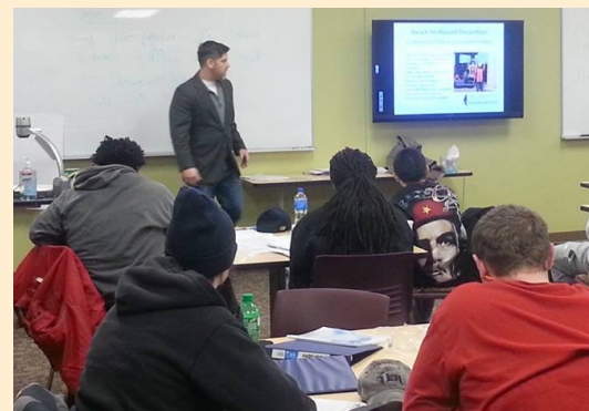
OSHA training at YouthBuild